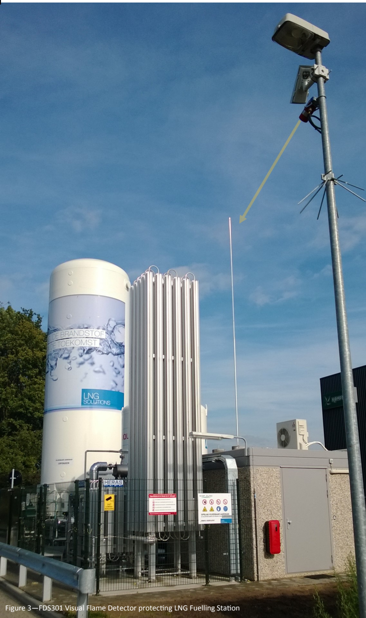
Figure 3—FDS301 Visual Flame Detector protecting LNG Fuelling Station