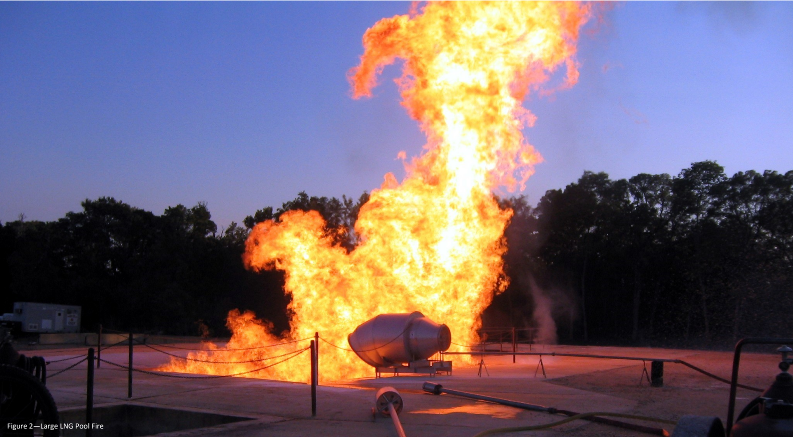
Figure 2—Large LNG Pool Fire